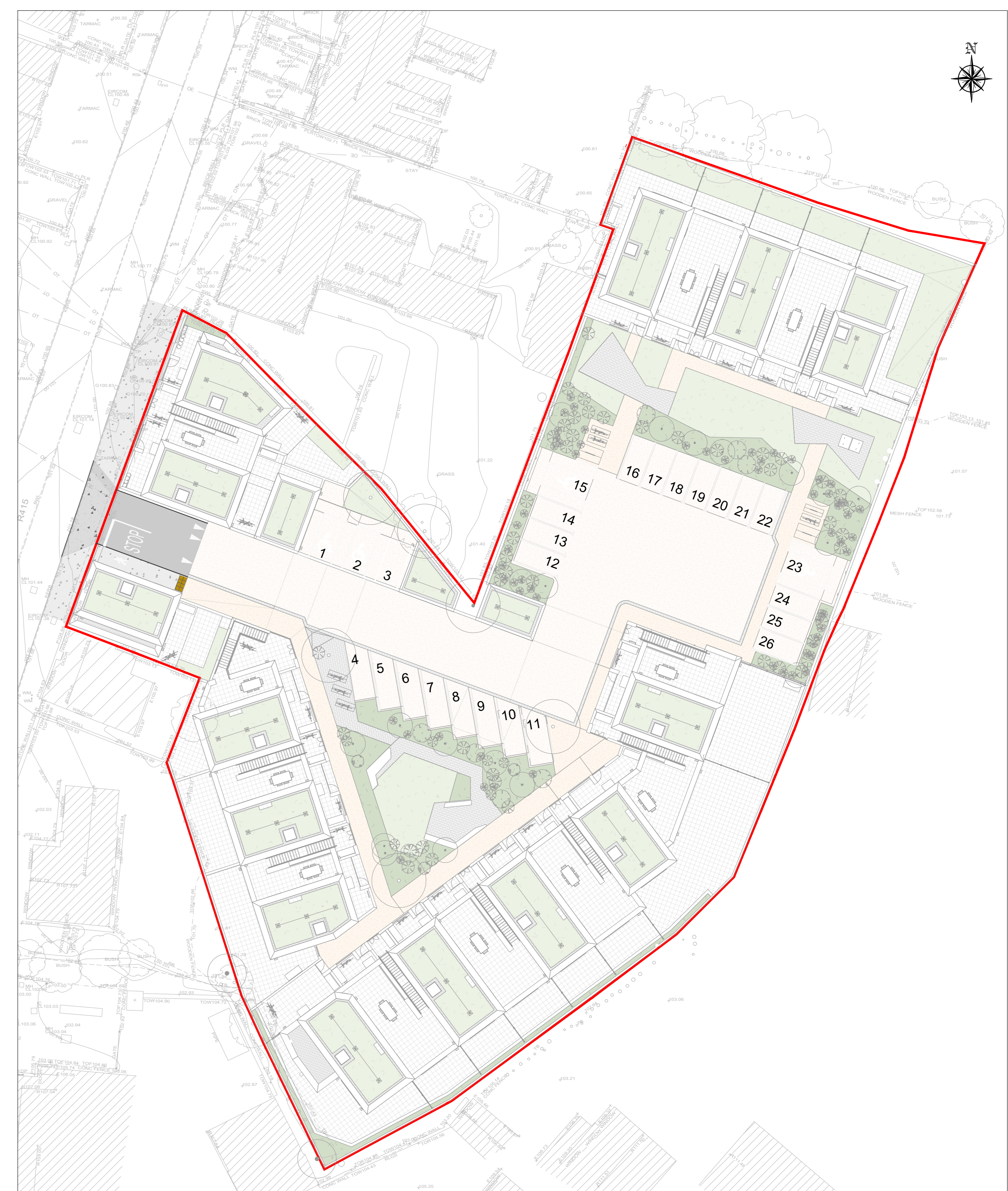
KEY PLAN. SCALE 1:250

PLANNING DRAWING. NOT FOR CONSTRUCTION. ALL LEVELS GIVEN ARE RELATIVE TO ORDNANCE DATUM. THIS DRAWING HAS BEEN ISSUED FOR INFORMATION PURPOSES ONLY AND MUST NOT BE USED FOR CONSTRUCTION UNDER ANY CIRCUMSTANCES